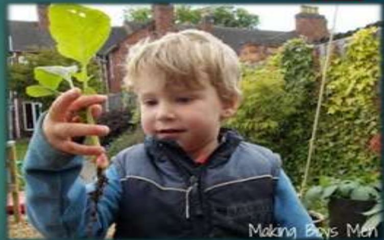
- Identifying the Parts of the Plants