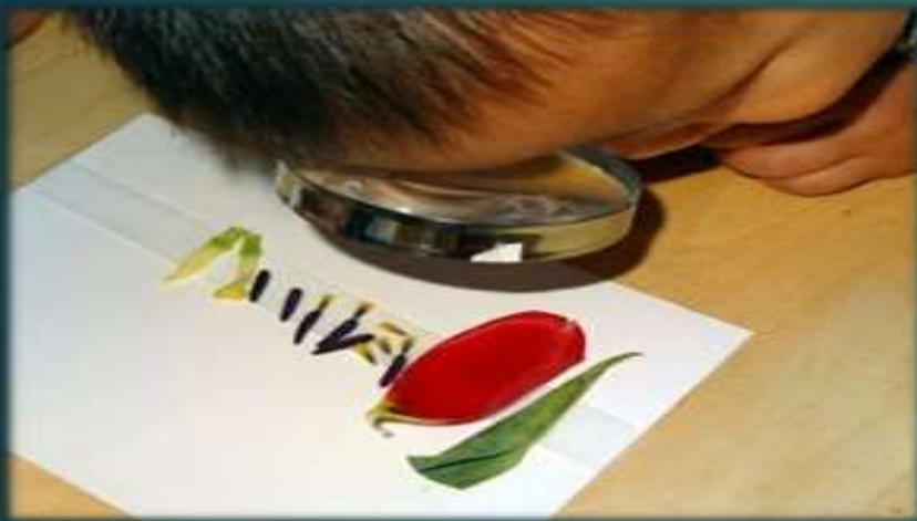
- Discover the Parts of the Flowers